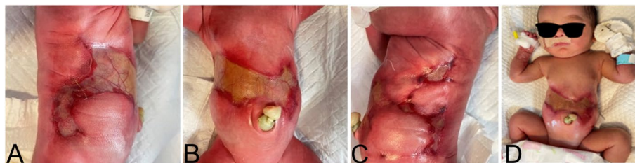
Fig. 1 Symmetrical skin defects in the abdomen and bilateral trunk

Type V ACC is rare, associated with fetus papyraceus or placental infarction, and characterized by a symmetrical and H-shaped distribution over the trunk and