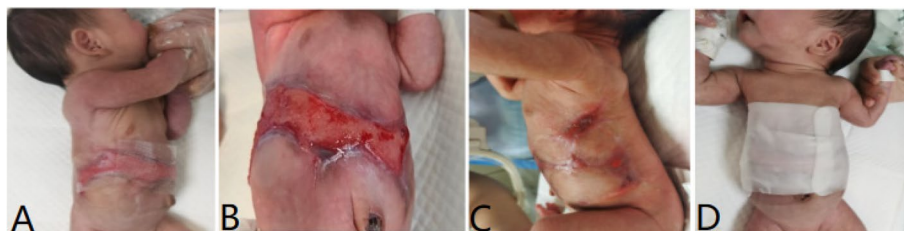
Fig. 2 Significant improvement after 5 weeks with lipid hydrogel foam dressing, silicone foam dressing, and growth factors