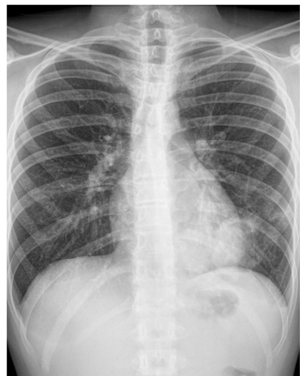
Fig. 4 Frontal chest x-ray performed on day 14 showing an improvement of the opacity

However, the paucity of reports may reflect the erroneous dismissal of isolates as contaminants [4]. Furthermore, the indolent disease course and the initial improvement without an appropriate antibiotic therapy supports the hypothesis of under-diagnosis [6]. Additionally, the frequently used empiric treatments for