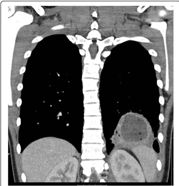
Fig. 3 Frontal plane of the chest CT scan

It was decided to admit the patient to the pediatric ward in order to administer intravenous antibiotics and to maintain a closer surveillance.