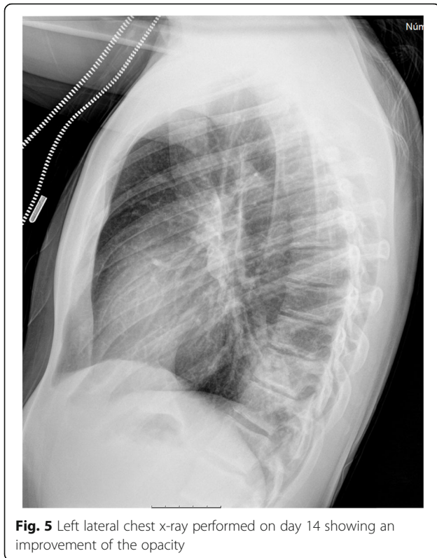
Fig. 5 Left lateral chest x-ray performed on day 14 showing an improvement of the opacity

pneumonia, which contain penicillin or amoxicillin may resolve most of the lower respiratory airway diseases, contributing to a low number of case reports [6].