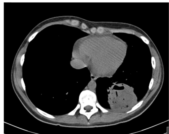
Fig. 2 Transverse plane of the chest CT scan showing the presence of the abscess