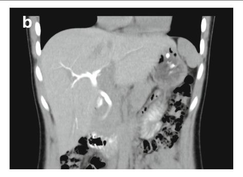
Fig. 2 Drip infusion cholecystocholangiography with computed tomography (DIC–CT) performed at 6 weeks after discharge. The bile ducts were analyzed by DIC–CT using a radiopaque dye as a contrast medium. We intravenously administered the dye, which accumulates preferentially in the tissue of gallbladder or bile ducts. The dye did not show any silhouette of the gallbladder, indicating the absence of the gallbladder. a Axial view, b coronal view