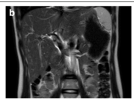
Fig. 1 Magnetic resonance cholangiopancreatography (MRCP) carried out on the fourth day of admission. The MRCP images could depict neither the gallbladder nor the cystic duct. The study showed no pancreaticobiliary maljunction. A hepatic cyst, which is a normal variant, was detected (shown by the arrow head). The cyst showed no continuity with the common bile duct. a Coronal image at maximum intensity projection, b T2 weighted coronal image

therefore, we prescribed smooth muscle relaxant and ursodeoxycholic acid. The outpatient follow-up is still ongoing, and febrile episodes have not been observed after discharge.