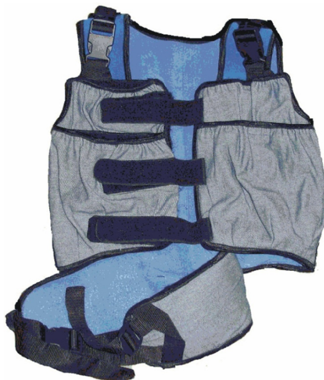
Figure 1 Weight vest.

At the leg-press station resistance was applied by the leg-press machine itself, which was specifically adapted for children by means of an elevated footplate (EN-Dynamic Seated Leg Press, Enraf Nonius, The Netherlands). At the other loaded stations, where functional exercises were performed, resistance was applied by means of a customised weight vest (see Figure 1).