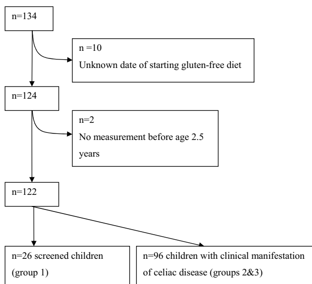
Figure 1 Flow chart of children with CD used in the study.

The first CD group was asymptomatic or featured symptoms that were not signalled by the parents or the general practitioners. Therefore, this group was analyzed separately (screened group). The second and third CD groups were clinically diagnosed and we reasoned that these two groups could be pooled (symptomatic group).