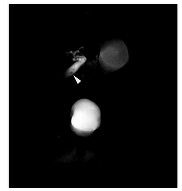
Fig. 1 MRCP image, white arrow indicating the possible presence of common bile duct stones

Considering the severe biliary obstruction in the patient, ERCP is prioritized as the initial procedure. The infant was positioned prone and underwent ERCP under general anesthesia with intubation (endotracheal tube inner diameter 3.5mm). An Olympus JF-260V duodenoscope was employed for the procedure. The duodenal papilla exhibited a papillary appearance (Fig. 2A). Successful selective biliary cannulation was achieved using a twolumen Dreamtome<sup>TM</sup> RX Cannulating Sphincterotome (Boston Scientific) and a 0.035-inch Dreamtome<sup>™</sup> guide wire (Boston Scientific). Cholangiography was conducted from the upper to lower segments of the CBD. The CBD had a diameter of 0.4 cm at its widest part, displaying mild dilatation without evident significant contrast filling defects (Fig. 2B). No dilatation of the intrahepatic bile duct was observed. A longitudinal incision measuring 0.2 cm was made at the 11 o'clock position on the papilla of the bile duct. Multiple sediment-like stones (Fig. 2C) were successively removed using a stone retrieval balloon (Cook Medical). Following the absence of bleeding, a 7 Fr straight-tip nasal biliary drainage catheter (Cook Medical) was inserted (Fig. 2D). The patient was transferred to the ward after the removal of the endotracheal tube, displaying stable vital signs. No post-operative complications occurred following the ERCP procedure.