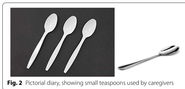
Fig. 2 Pictorial diary, showing small teaspoons used by caregivers

The caregivers store the antibiotics in a plastic bag in a cool place to avoid damaging them and they keep them away from their children. Caregivers said that they practice this to prevent water, and sunlight damage the antibiotics.