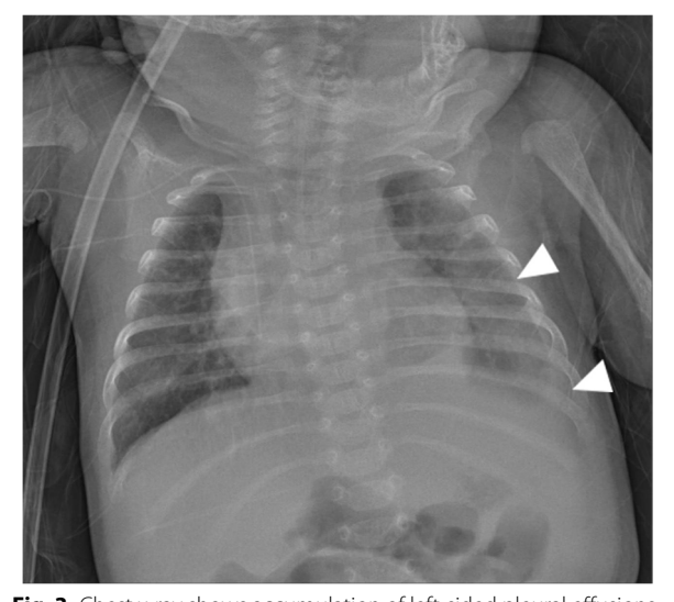
Fig. 3 Chest x-ray shows accumulation of left-sided pleural effusions with decreased left lung volume

tube was inserted for continuous draining. The volume of chest tube draining was around 30-50ml/kg/d. Chemical pleurodesis with erythromycin was tried twice, but barely effective. Unfortunately, he developed progressively respiratory distress at 3 months of life, and has to back on mechanical ventilation eventually.