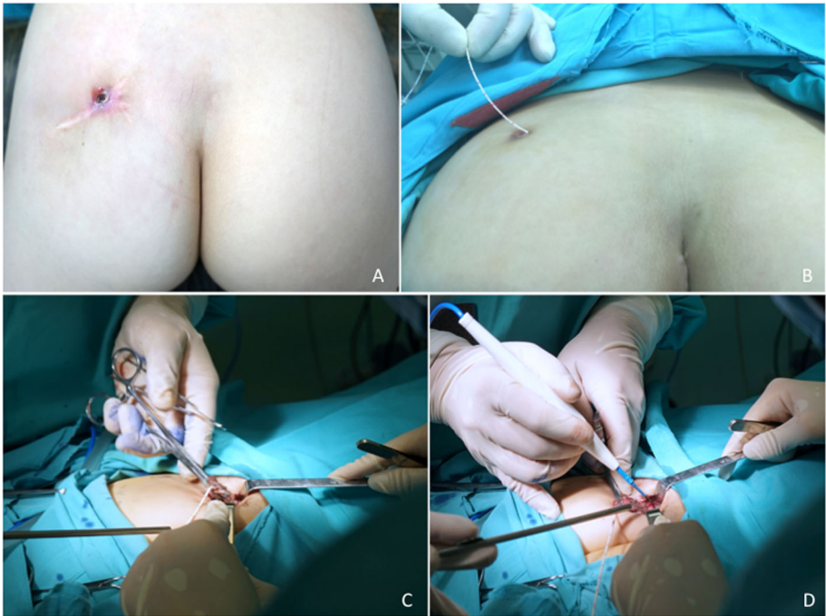
Fig. 2 Surgical procedures. The patient was placed in a prone position to expose the dimple (a), and we inserted the ureteral catheter through the dimple to the sinus tract and injected methylene blue (b). Dissection should be close to the tract layer-by-layer (c-d) until the retrorectal space is reached