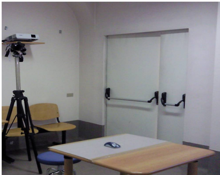
Figure 2 The setting. The photograph shows the original setting. As detailed in the text, the camcorder was placed behind the children, 2 meters high and skewed downwards 120 degrees (so to equal humerus inclination on the forearm).

As expected, under ERROR condition children made a lower number of errors (i.e. touched the walls of the labyrinth less often); time used to complete each task instead was not significantly different.