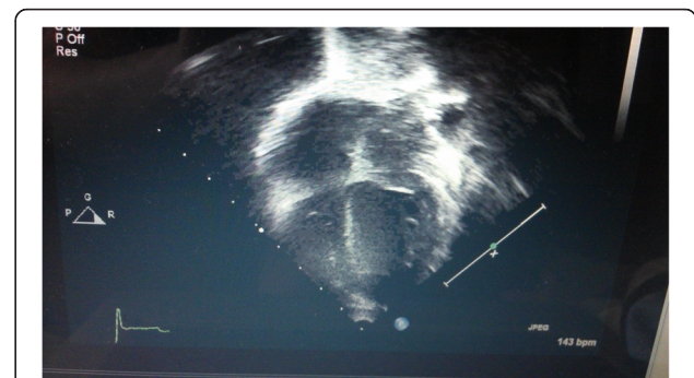
Figure 2 Apparently normal echocardiography after selenium therapy in a 15-month male infant.