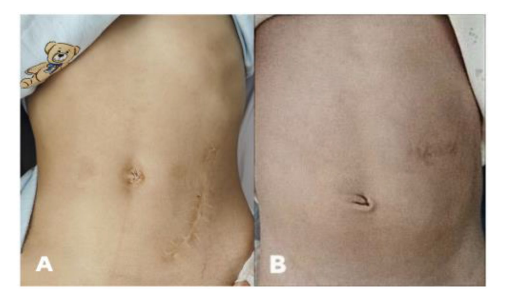
Fig. 2 Comparison of postoperative incision scars. (A) Oblique incision in anti-mcburney's point of Peña's descending colostomy. (B) Transverse incision in the left upper abdomen of the MDCDLO

satisfaction from the patients' parents because the left upper abdominal transverse incision along the dermatoglyph led to a smaller incision scar compared with the oblique incision in the anti-mcburney's point of the sigmoid colon isolated ostomy (Fig. 2).