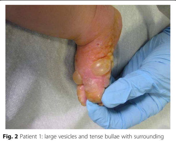
erythema located in feet, with palm and sole involvement

steroid treatment, the patient was subjected to a strict follow-up: therapy was well tolerated, with no adverse effects, as hypertension, weight gain, hyperglycemia or other blood test alterations. Prednisone was carefully tapered off over a 2-month period with no evidence of disease relapse and currently the patient is still in remission. Resumption of the vaccination schedule did not induce any recurrence of the disease.